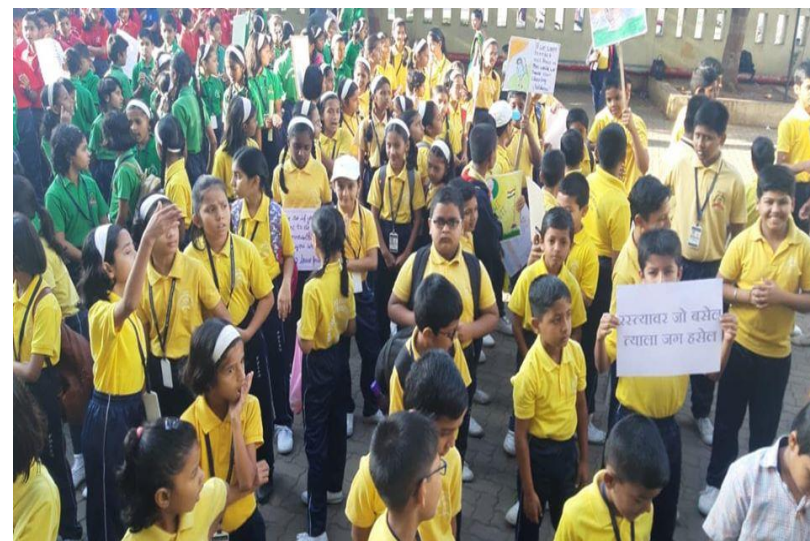
Global Warming Rally (2019 – 20)