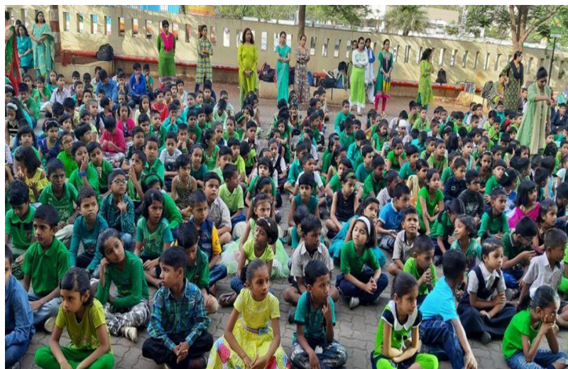
GO Green (2019-20)