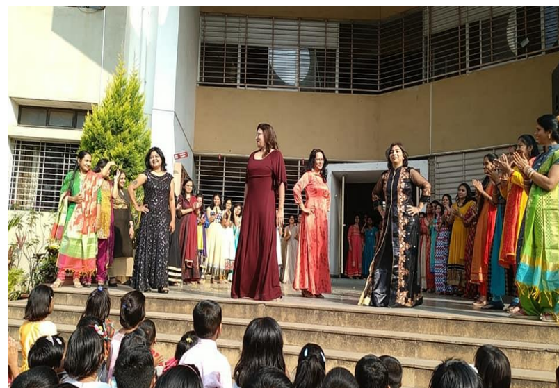
Children's Day celebration (2019)