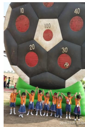
School Picnic @ Funland(2019-20)