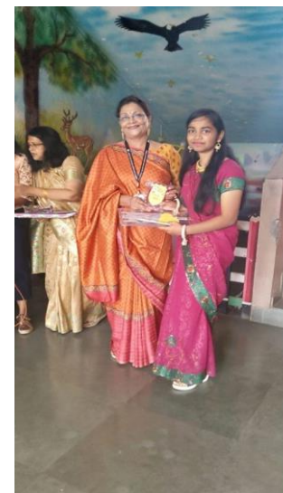
Farewell of class x(2019-20)