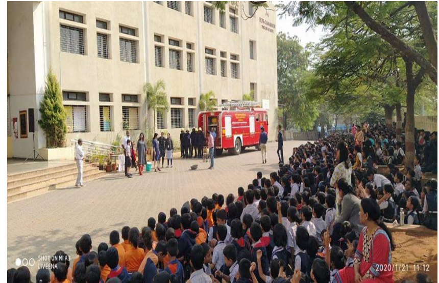
Fire Safety Drill (2019-2020)