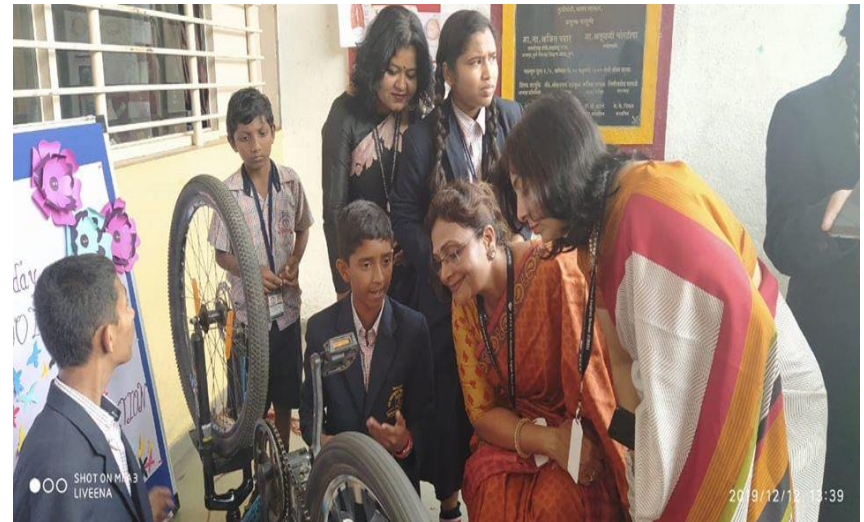
Science exhibition (2019-20)