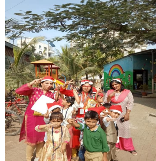
Christmas day celebration (2019-20)