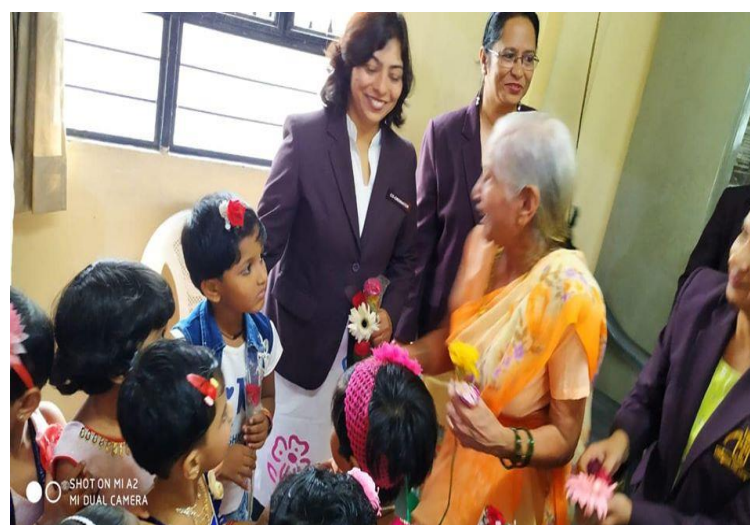
Grand Parents day celebration (2019-20)