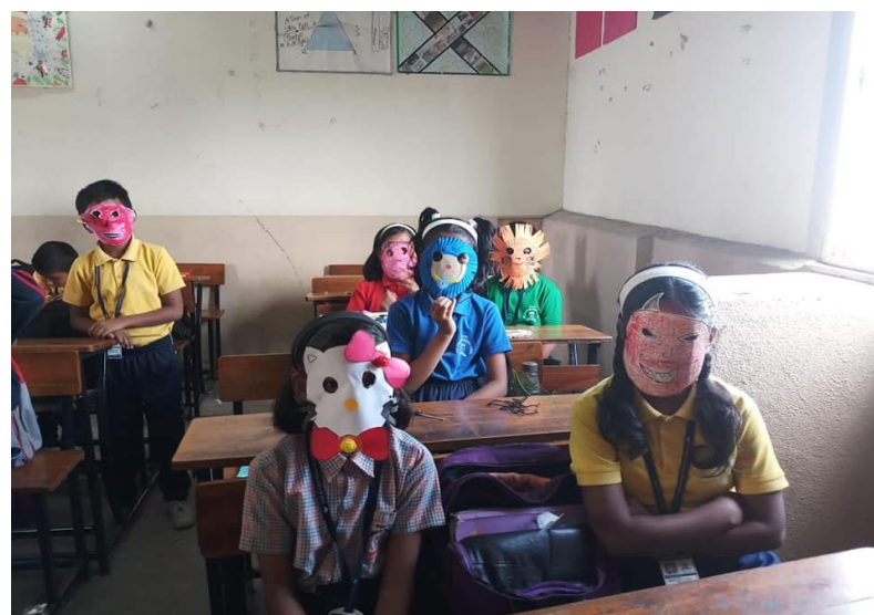
Swatchh Bharat Abhiyaan (2019 – 20)