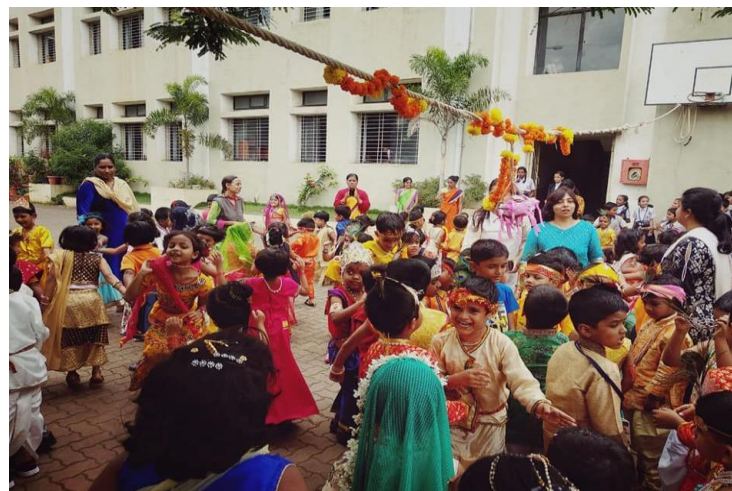
Dahi Handi celebration (2019 – 20)