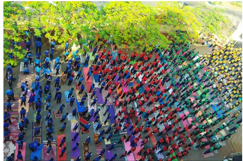
International Yoga Day (2019-2020)