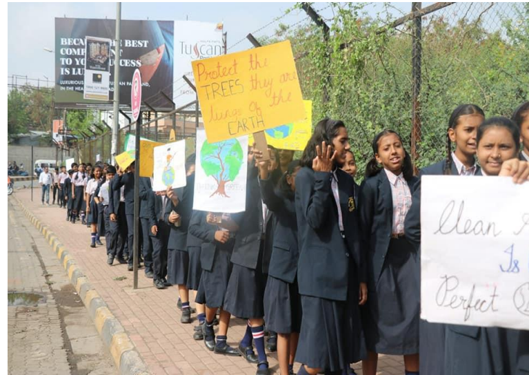
Anti Plastic Rally (2019 – 20)