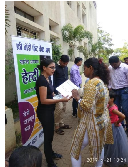
Health Check up (2019 – 20)