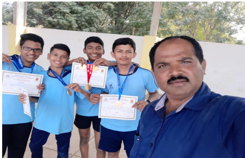
Inter Sports house competitions (2019 – 20)