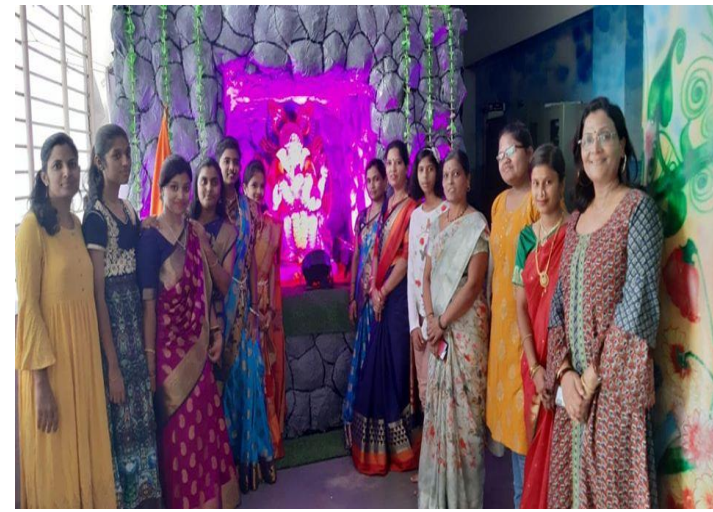
Ganpati celebration (2019-20)