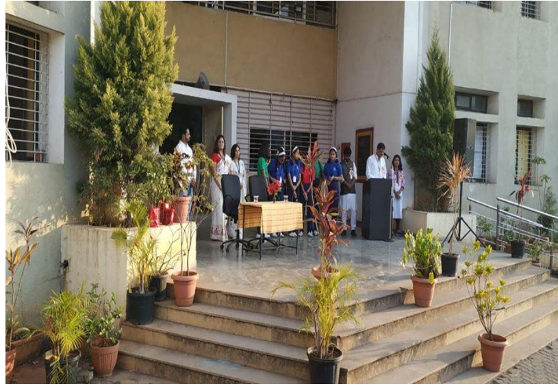
26 January Republic Day