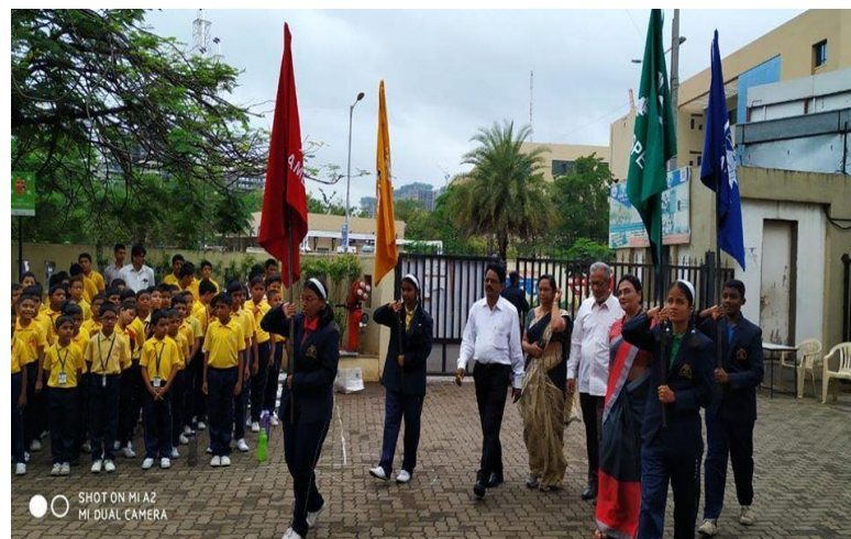
Investiture Ceremony (2019 – 20)